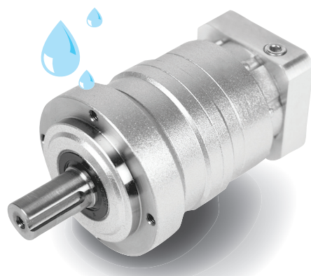
PlanetGear VRL, Type 582