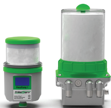
FlexxPump1 ND and 4 D